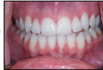
Figure 3: Recession, inadequate zones of attached gingiva, and heavy tension. Requires a combination of procedures done at different times.