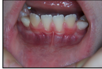
Figure 2: Could do separate procedures or at the same time and save the patient some pain and money.

Figure 4 is a prime example of needing a simple frenectomy on the maxil-