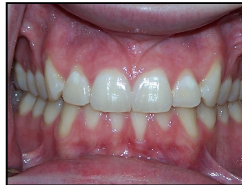
Figure 4: Maxillary frenum too close to incisive papilla. If not released, irreparable interproximal recession.

lary anterior due to the position of the frenum and the proximity to the incisive papilla. Without removal, this area will experience irreparable interproximal recession.