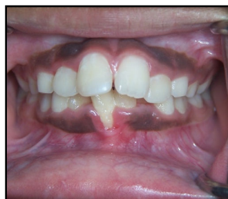
Figure 1: Perfect case when a frenec- tomy and a soft tissue graft should have been done.

Soft tissue grafting procedures are done